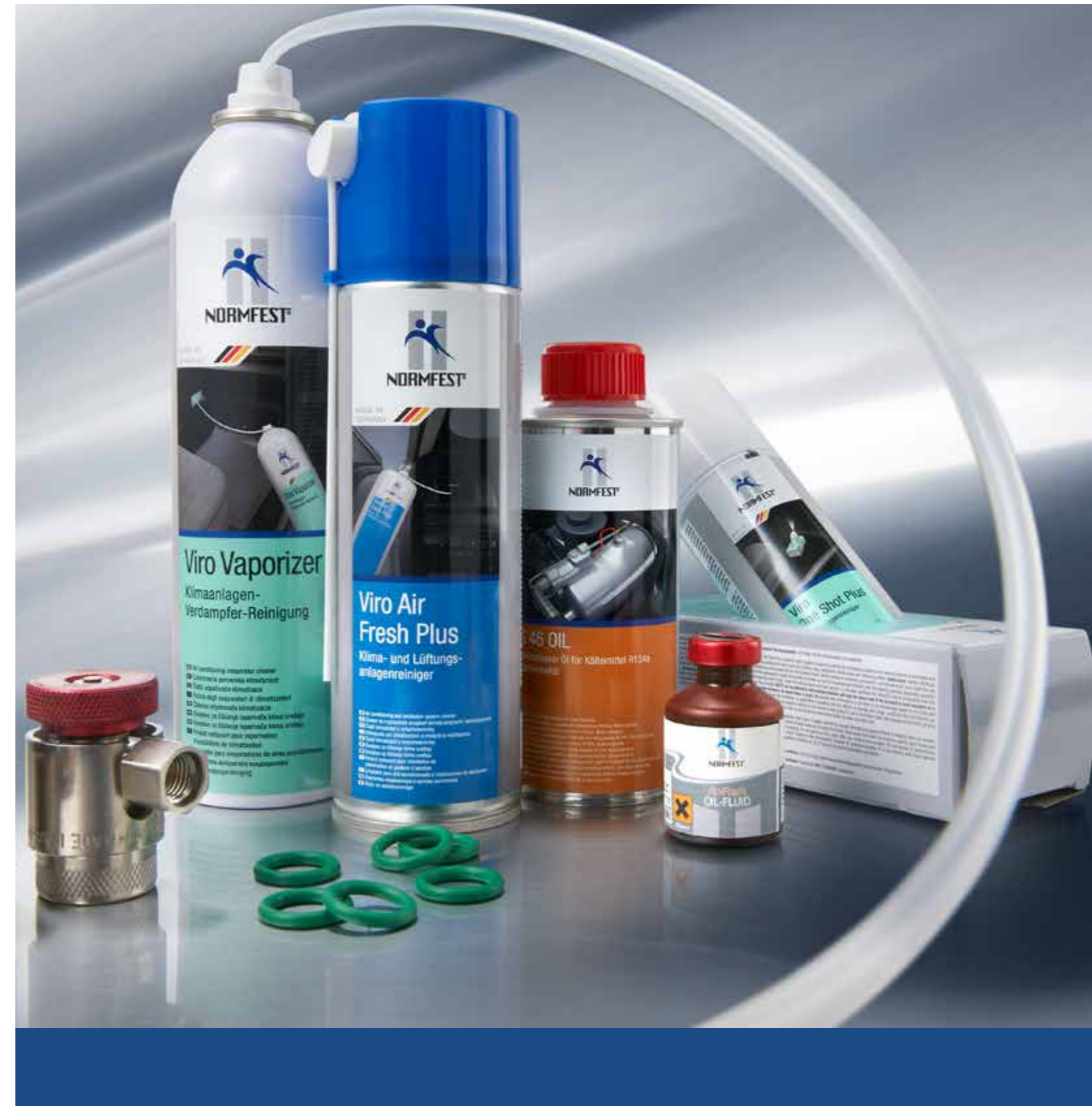
Car air conditioning